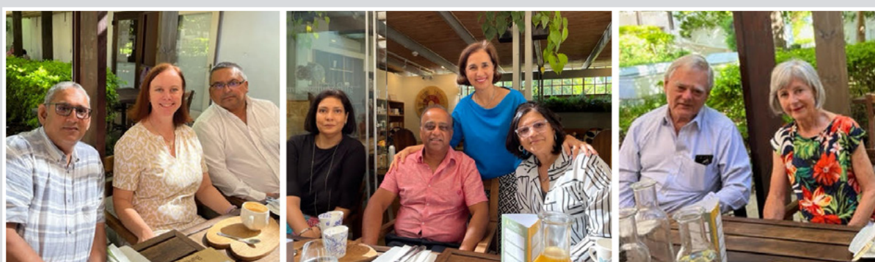
EMBRACING DIFFERENCE DOING THINGS DIFFERENTLY MAKING A DIFFERENCE