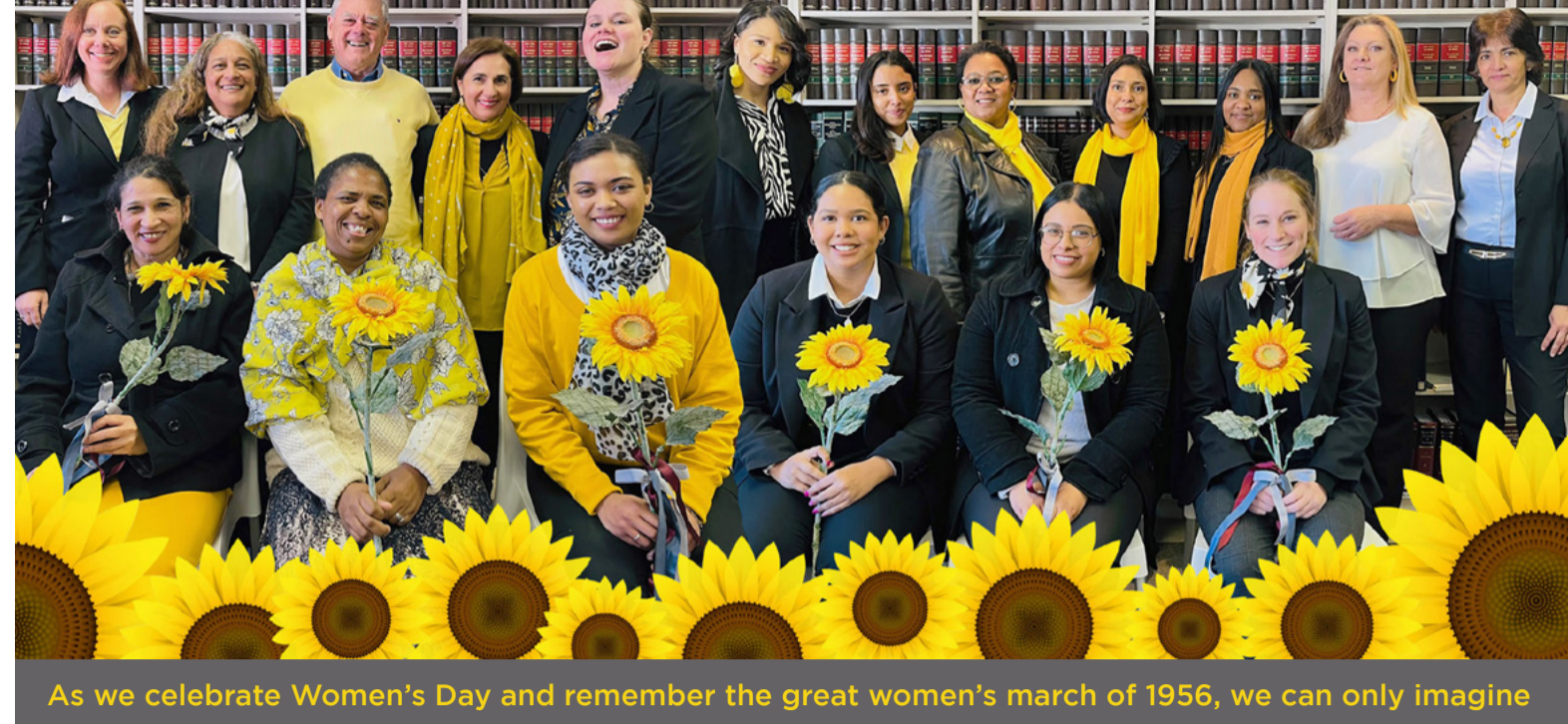
As we celebrate Women's Day and remember the great women's march of 1956, we can only imagine how much effort and determination went into the orchestration of this transformative event.