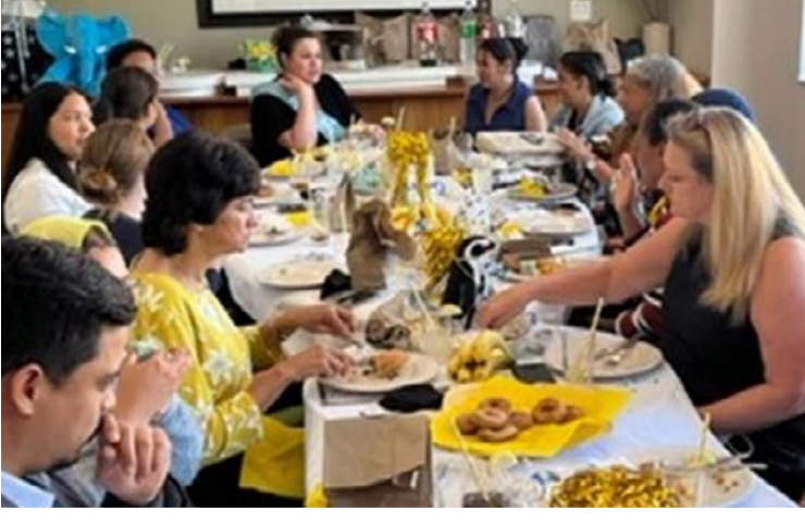
Tucking into some colourful treats at our staff lunch, held in the boardroom.

Our 2022 theme of 'Looking on the Bright Side' has certainly brought an element of fun and joy to our monthly staff lunches. Table decor pops with colour, creative ideas have presented our meals, and outfits have included the brightest of brights. We really enjoy looking on the bright side!