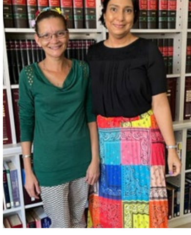
Suitably dressed to brighten up the occasion.