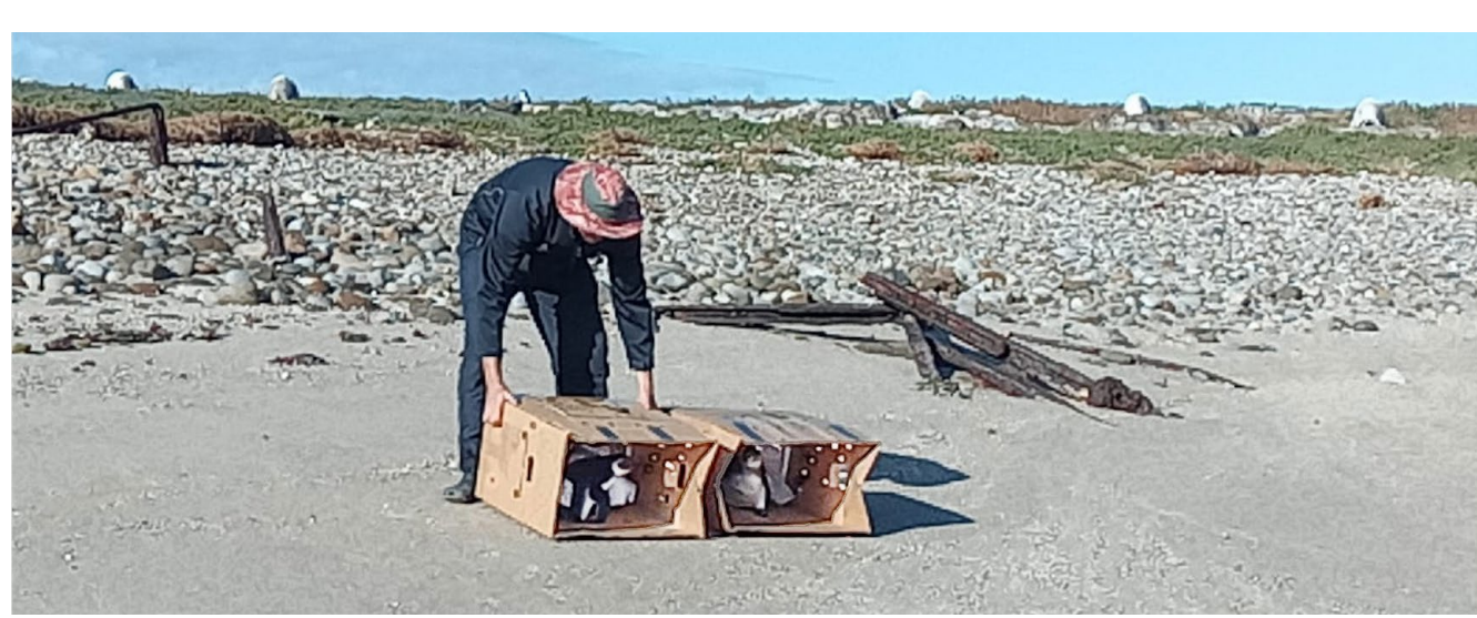
Photo taken by rangers when they were releasing Pinky & Matzi at Bird Island.

The Penguin Project aims to promote the desirable characteristics of penguins, and reward staff who also look smart; are warm, friendly and charming; loyal and devoted; united, sociable and adaptable and thrive even in adverse circumstances.