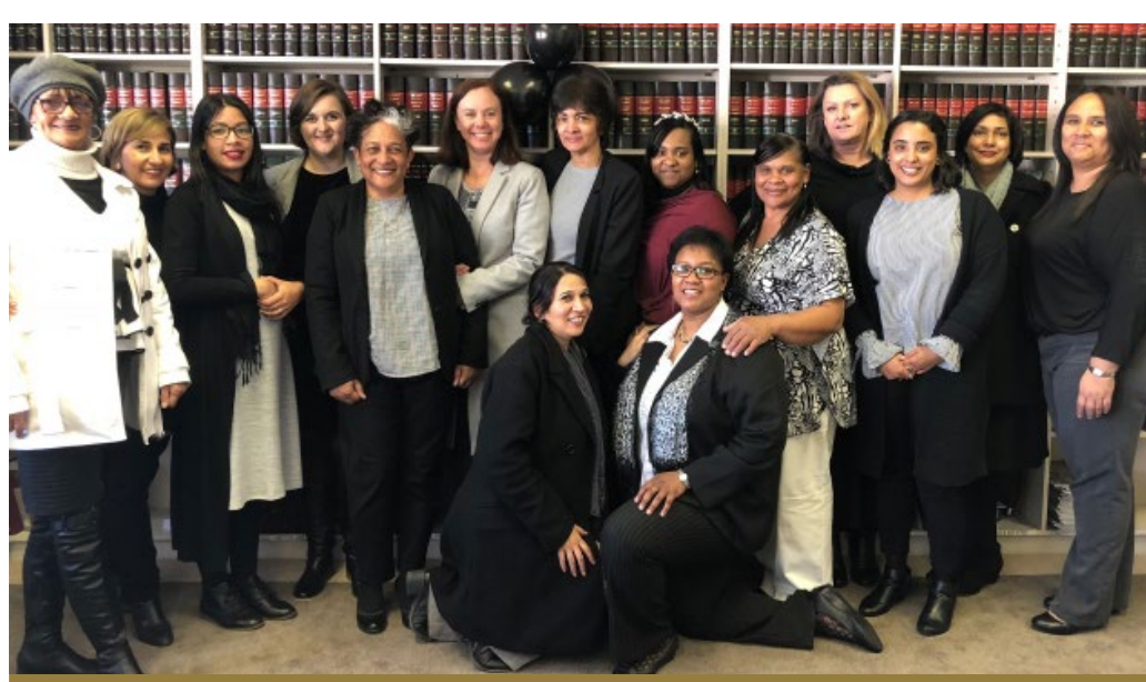
The women of Pincus Matz wish everyone a Happy Women's month. May we all go to great places and be the change we want to see.

At this time of year we remember the brave women who fought boldly for women's rights. We value the difference that they made 62 years ago!